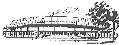
SITE OF 1984 OLYMPICS BOXING COMPETITION